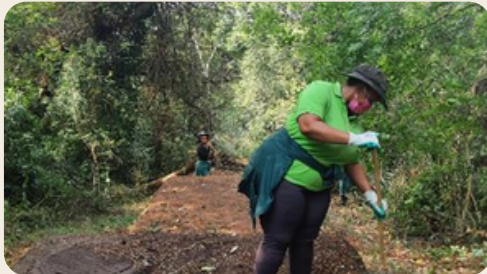
The sewer pipeline has been treated, cleaned, and treated for tree roots and invasive plants. Follow-up maintenance will continue in the 2023.