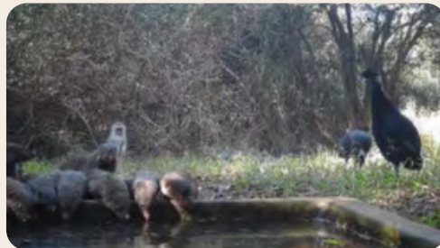
Banded-mongoose, Crested Guinea fowl and Vervet monkeys at the forest water-hole in winter.