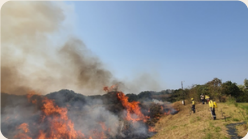
The annual prescribed burning was conducted on 5 ha of the eastern portion of the reserve during August 2022.