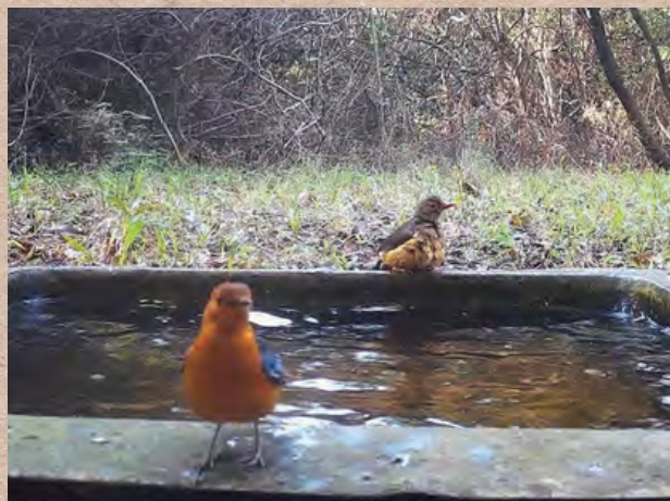
A Red Capped Robin & Olive Thrush