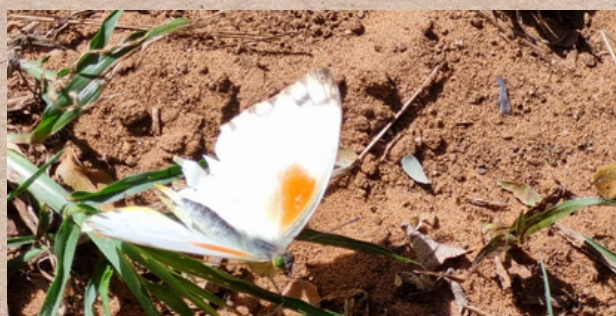
The Nepheronia argia , also known as the Large Vagrant, likely feeds on plants from the Celstralaciae, Rhizophoraceae, and Oleaceae families, which all occur in forest areas