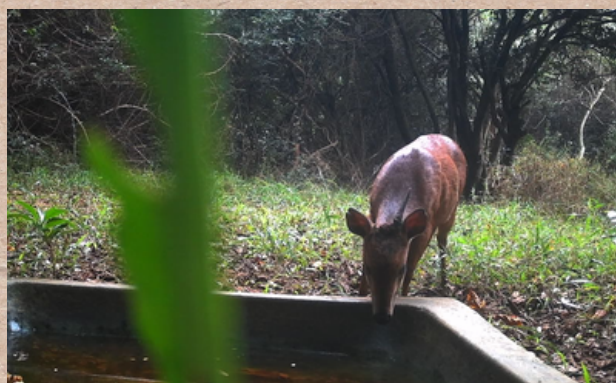
The male one-horned Red Duiker has been visiting the water point regularly in May